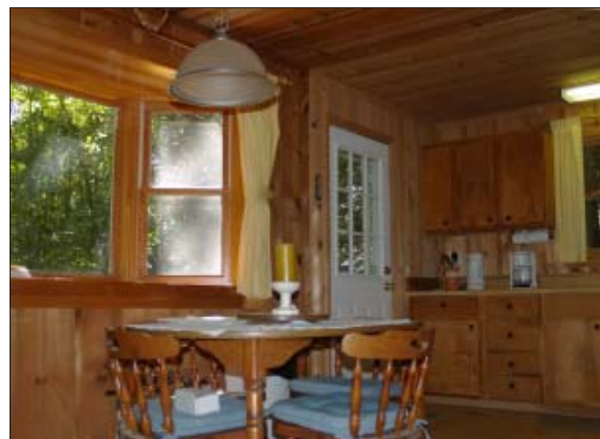
SPACIOUS EAT-IN KITCHEN WITH BAY WINDOW AND ABUNDANCE OF CUP- BOARDS