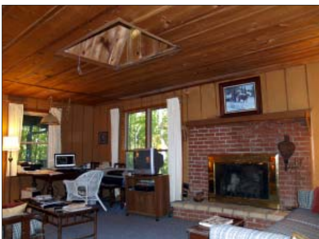
LIVING AREA WITH GAS LOG FIREPLACE AND SKYLIGHT