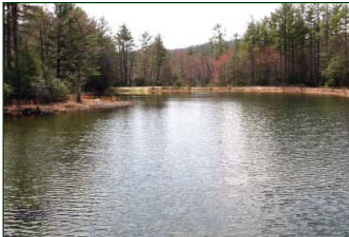
Access deeded to this lake (across road from lot) for canoeing or kayaking

The perfect place for a true mountain retreat. Adjoined by Forest Service lands on the back boundary, the setting offers peace, quiet, access to a small picturesque lake, and miles of hiking adventures. Only a short distance away is the Iron Bridge over the Chattooga River with its cascading waterfalls and wonderful mountain trout waters. There is a shared community spring water system (water lines are in place to the lot), a basic driveway has been created, and there is a choice of building sites. One site has been cleared at the top of the lot. This site may offer some nice mountain views.