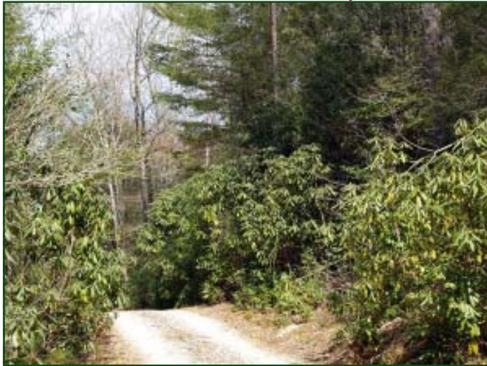
Private road - lot is on the right