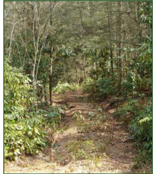
Driveway into property

The perfect place for a true mountain retreat. Adjoined by Forest Service lands on the back boundary, the setting offers peace, quiet, access to a small picturesque lake, and miles of hiking adventures. Only a short distance away is the Iron Bridge over the Chattooga River with its cascading waterfalls and wonderful mountain trout waters. There is a shared community spring water system (water lines are in place to the lot), a basic driveway has been created, and there is a choice of building sites. One site has been cleared at the top of the lot. This site may offer some nice mountain views.