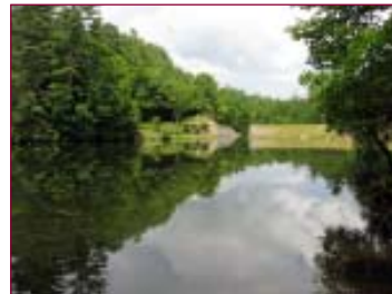
LAZY SUMMER DAYS