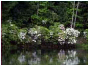
SPRING AT INDIAN LAKES

Homeowners Association Annual Fee - $834 for 2008