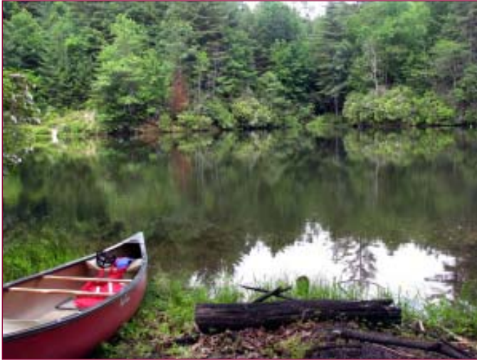
~ Wonderful flat area at the lakeside ~