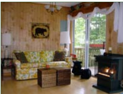
WNC Regional MLS: 406989