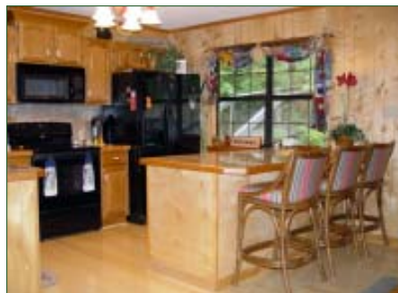
Highlands-Cashiers MLS: 64583