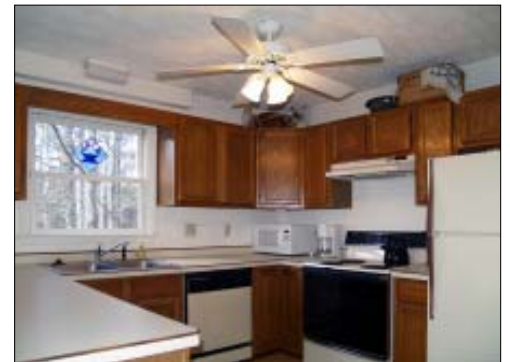
Efficient, roomy kitchen

Upon entry, the fireplace is to your left, the living and dining areas, open deck and screen porch flow across the full width of the unit. A counter height bar separates the dining area from the kitchen.