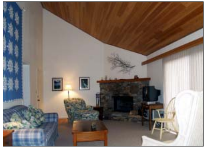
Living area as seen from dining area