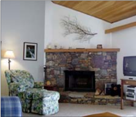
Wood burning stone fireplace