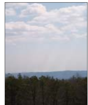
.....always, the views