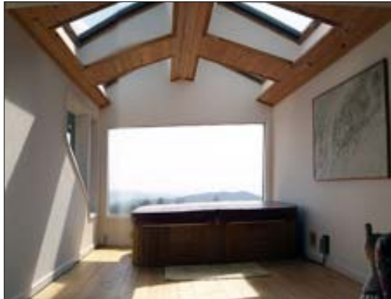
Sunroom with skylights and hot tub

Entry to the master bedroom is from the sitting room. As the other spaces on this level, it features cathedral ceilings and has a private bath. And always, there are the magnificent views.