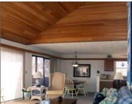
From entry to dining area

Upon entry, the fireplace is to your left, the living and dining areas, open deck and screen porch flow across the full width of the unit. A counter height bar separates the dining area from the kitchen.