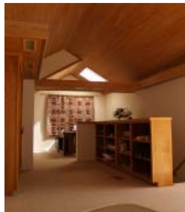
Area from sitting room to....