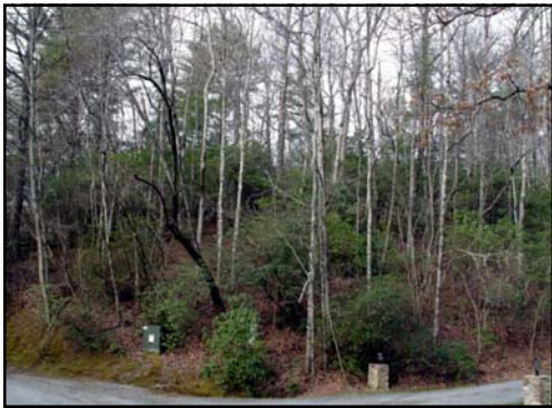
Less than a 5 minute walk to two lakes!