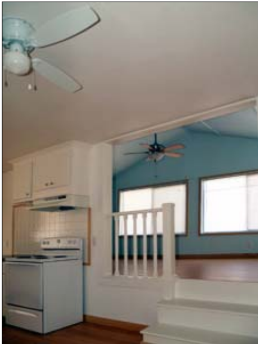
Entry with kitchen to left with living area above