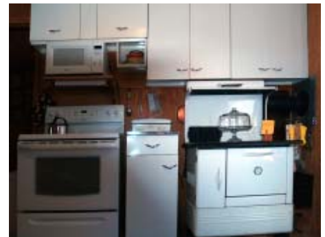
Eat-in kitchen with lots of counter space and cabinets ~ “Melissa” in right photo