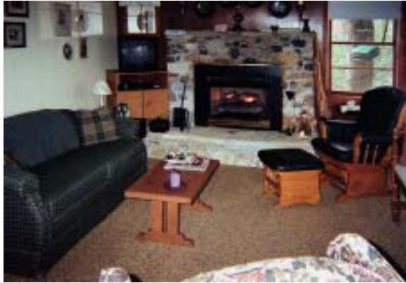
Living room with gas log stone fireplace and picture window to deck and view