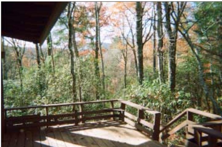
Late fall view from deck

Additional lot by same owner available for $5,000 with purchase of cottage.