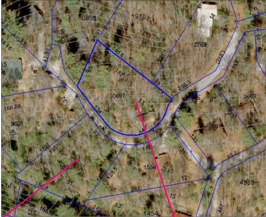
Rabbit Run Cottage

Additional lot by same owner available for $5,000 with purchase of cottage.