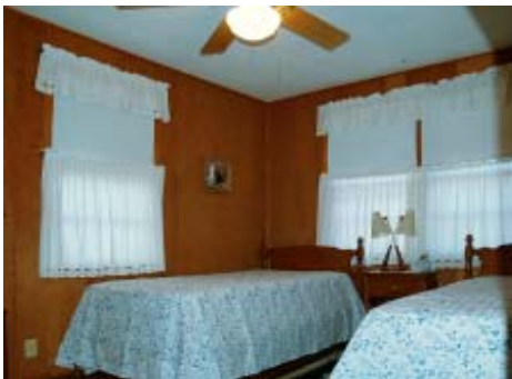
One of the two bedrooms

2010 PROPERTY TAX: $285 LOT SIZE: .531 ACRE