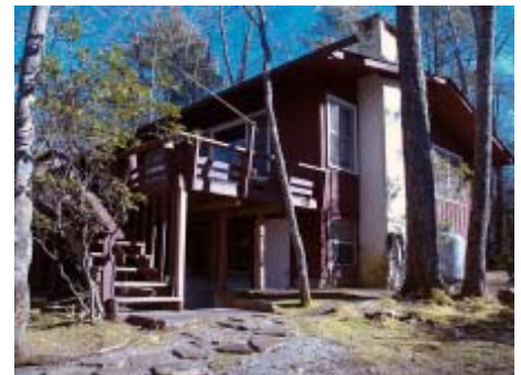
Rabbit Run from the backyard

ACCESS VIA STATE MAINTAINED ROAD ~ NO FEES