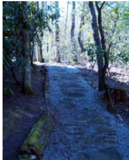
One of the stone walkways

2010 PROPERTY TAX: $285 LOT SIZE: .531 ACRE