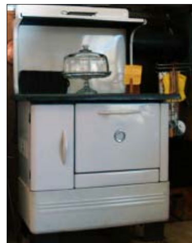
Close-up of “Melissa”