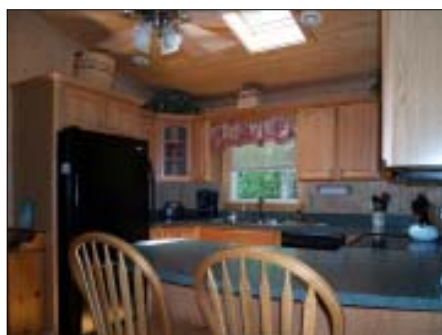
KITCHEN FROM DINING ROOM