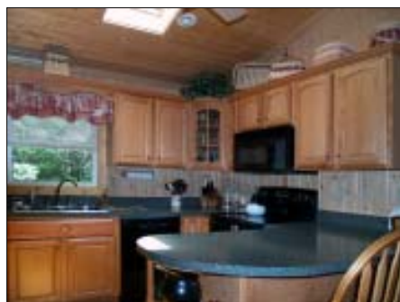
KITCHEN FROM LIVING ROOM