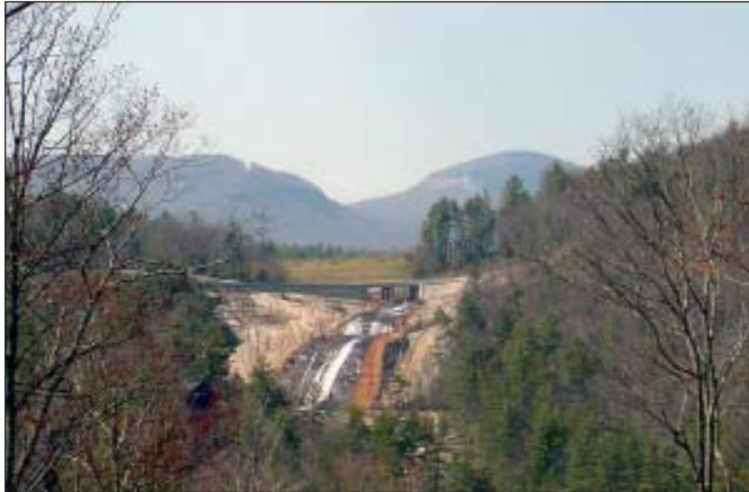
Photo taken from deck of adjacent home

This is one of the last homesites available that will provide the potential for building your mountain home with such a fantastic view of Toxaway Falls. The lot features a variety of hardwoods, beautiful rhododendrons, mountain laurel, and native ferns.