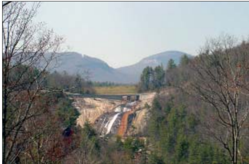
Photo taken from deck of adjacent home

This is one of the last homesites available that will provide the potential for building your mountain home with such a fantastic view of Toxaway Falls. The lot features a variety of hardwoods, beautiful rhododendrons, mountain laurel, and native ferns.