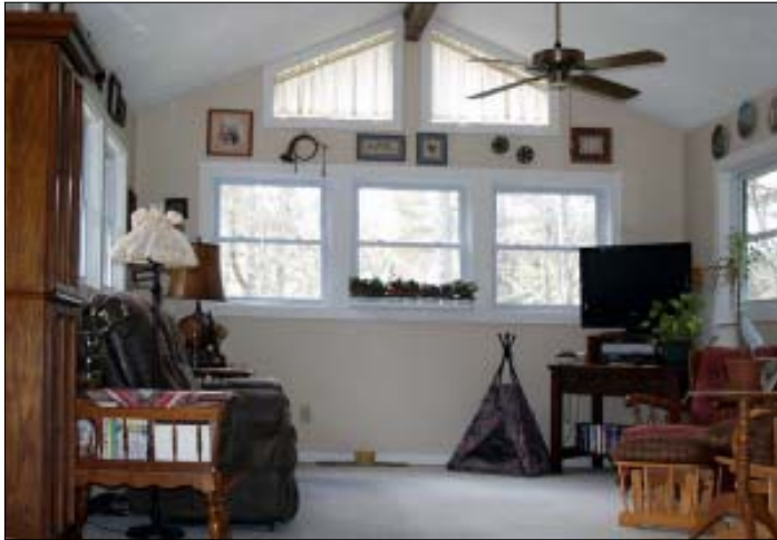
LIVING ROOM ~ CATHEDRAL CEILING