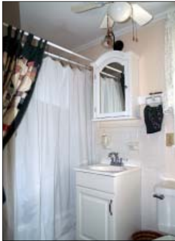
MASTER BEDROOM AND MASTER BATH