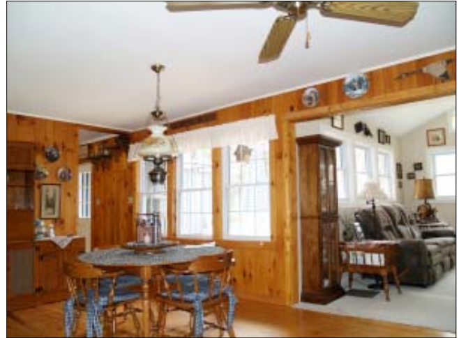
DINING ROOM ~ LIVING ROOM TO RIGHT ~ KITCHEN TO LEFT