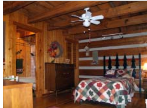
Main level bedroom may also be the master if preferred - there is an adjoining bath with claw foot tub and shower - this bath is also accessed from kitchen/dining area