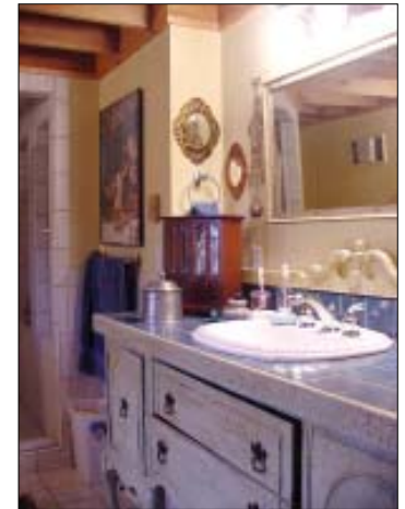
Master suite with sitting area and a private covered porch Master bath features a jet tub, full tile shower and unique vanity