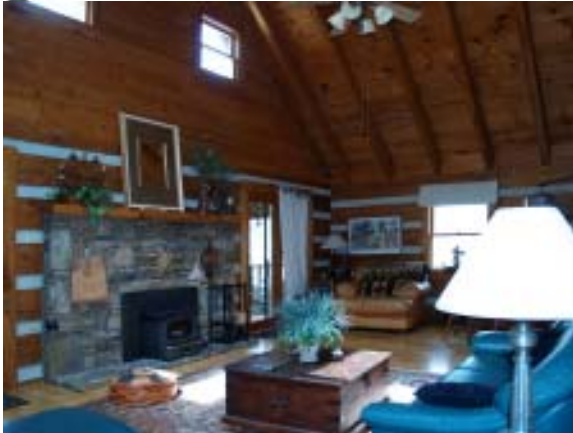
View upon entering the great room