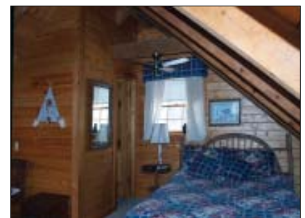
Loft bedroom, above, also has skylights and a half bath.