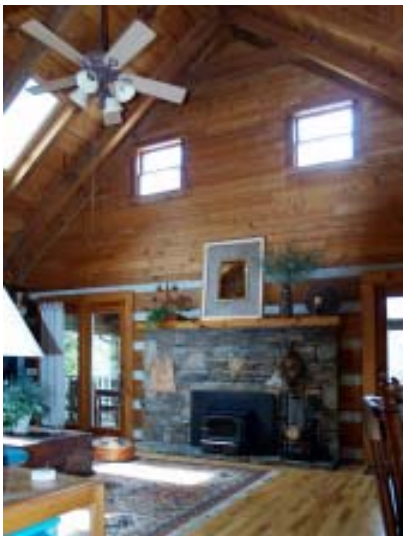
Dining area toward fireplace and from fireplace toward dining