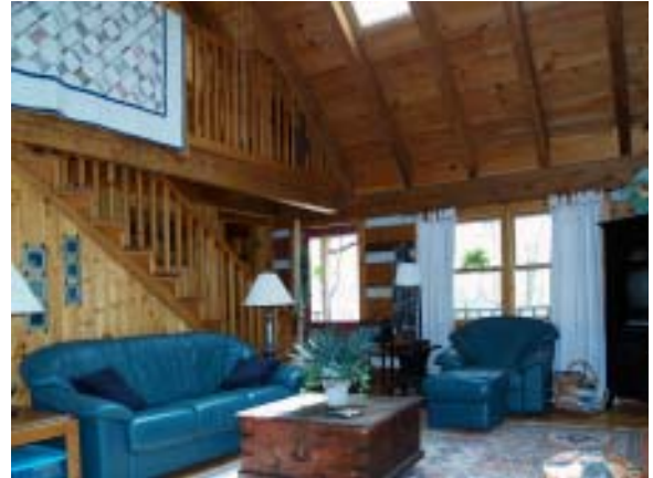
View toward the front door