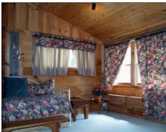
The bonus room, left, is separated from the main level of the home by the garage. Currently used as additional sleeping quarters, its utilization as an office, art studio or crafts room is truly a bonus.